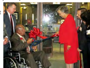
Ribbon cutting at the Grand Opening of the Ernest J. Gaines Center at Dupré Library.

The University of Louisiana at Lafayette recently learned that the University's accreditation has been reaffirmed by the Southern Association of Colleges and Schools (SACS). As part of its reaffirmation of accreditation, the University was required to develop and implement a Quality Enhancement Plan (QEP). For the QEP, the University chose to address the first-year experience in an effort to increase retention, success, and engagement of the first-year student and, hopefully, to make a continued impact beyond the first year. The QEP includes a first-year seminar, library learning commons, and learning communities. Through UNIV 100: First-year Seminar – Cajun Connection, the University strives to meet six student learning outcomes. One of the learning outcomes is “Select, locate and evaluate information resources held in Dupré Library and in digital formats.” Many of the librarians participated in the course content for the class, and they created a library assignment for the course. The QEP was well-received by SACS.