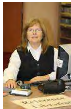
Judith Grunes Magale Library, Centenary College