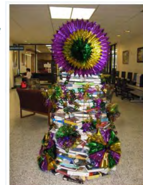
It's Carnival time at the Library!

Last fall, the Library collected exam copies of textbooks from faculty, sold the newest ones to BookSouth, and used the rest for a Christmas book tree. Now, there is a Mardi Gras edition of the lobby book tree.