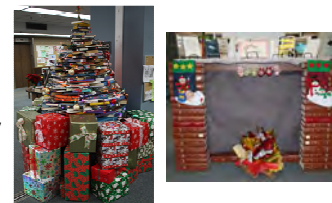
Christmastime in Prescott Library

This past Christmas several of the library faculty and staff came up with the idea for a different kind of Christmas tree - a book tree! It was constructed from a collection of donated books along with some of the library's Leisure Reading paperbacks. Decorated with lights and ornaments, the tree was a big hit with all of the library patrons as well as the student workers and all who work in the Library. In addition to the tree, a fireplace was also "built" from old copies of Zoological Record .