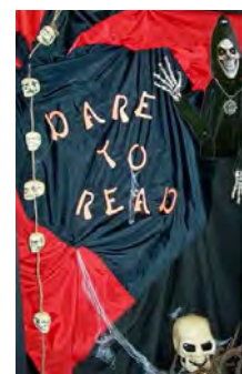
Exhibit on horror, crime, and mystery novels at Dupré Library.