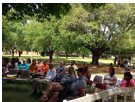
2014 poetry audience

LeDoux Library held several events this Spring. The second annual "Refreshments: Spring Poetry," event was held on April 23. The event